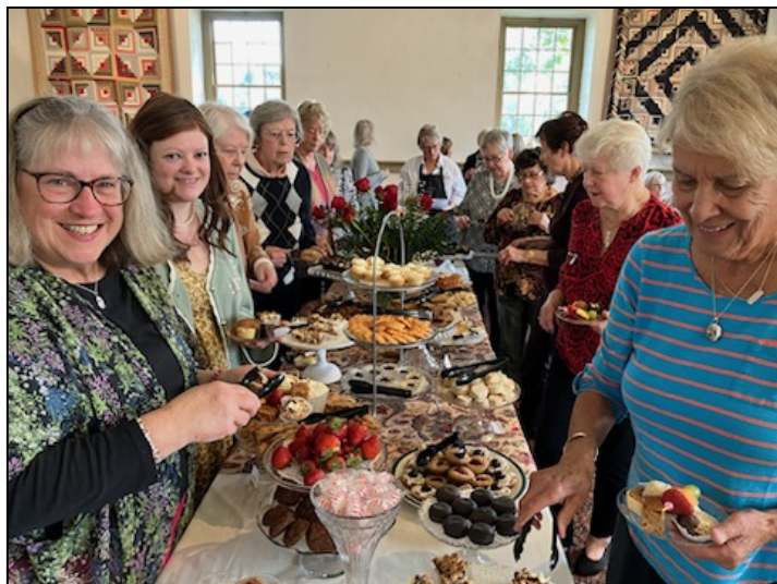
Attendees at "The Apples of Your Eye" tea in October smile as they select delectable treats from the dessert buffet.