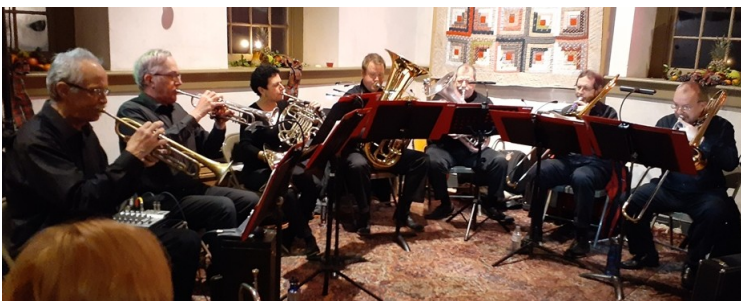
The Mount Laurel Brass in concert.

Kick off your holidays with a festive musical evening in the candlelit Wolf Academy. We are pleased to present the Mount Laurel Brass. This group of talented, accomplished musicians will entertain you with selections that range from beautiful holiday classics to rollicking funny selections.