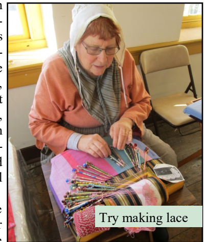
Try making lace